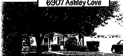
6907 Ashley Cove

3 BR, 2 BA, $195,900. On the lake! Open floorplan, Carolina Rm w/gas stove. Patio & attached storage shed. Phyllis 294-5650.