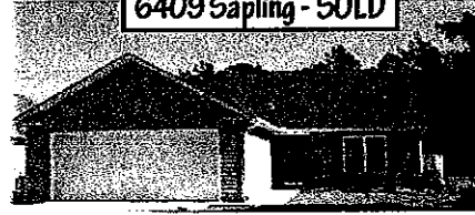
6409 Sapling - SOLD

3 BR, 2 BA. Great open floorplan, house has been lovingly care for. Phyllis 294-5650, 222-3365